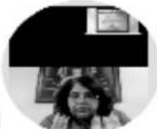
AAO SAPNE DEKHEN