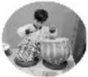
MAESTRO IN MAKING