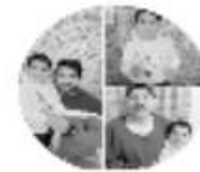
LIFE SKILL AND VALUE EDUCATION