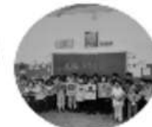
DROP EVERYTHING AND READ