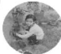
GREEN BIRTHDAY PROJECT